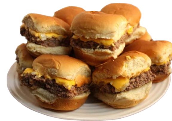
ceiling mount imago ii™ 5-slider

your lighting rep has recommended the ceiling mount imago ii™ fixture for your project Let's take a quick look: