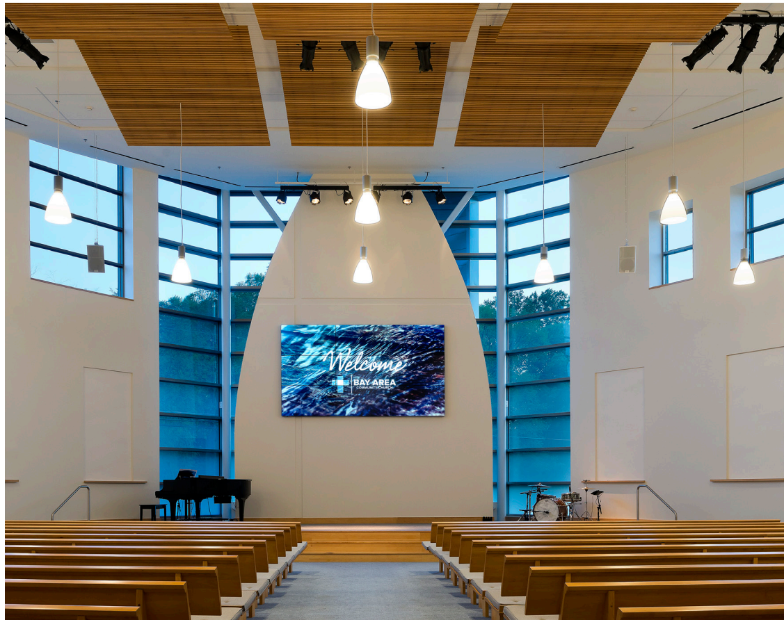
Bay Area Church | Waldon Studio | Paul Burk Photography